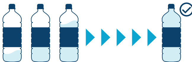
Figure 1. This advanced technology is needed in industrial settings to ensure specific manufacturing data is correctly sent and received. If using an example of a bottle-filling plant, industrial Ethernet automation technology is able to send filling data over the network to ensure the bottles are being filled as intended.

When using Ethernet, streams of data are separated into shorter pieces, or frames—each containing specific information such as the source and destination of the data. Such data is necessary in order for the network to accept and send data as needed.