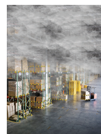
83% Less Time To Escape a Fire Than in the 1970s Due to Advances in Synthetic Building Materials