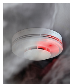
23% of Deaths Where Smoke Alarms Present But Disabled Due to False Alarms