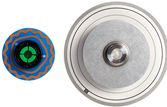
Figure 2: An optical glass disk (right) and AMT rotor (left) compared side by side

The AMT encoder's ASIC-based construction is far less susceptible to vibration than the fragile glass disk of an optical encoder.