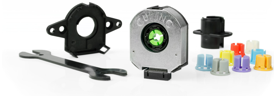
Figure 3: AMT31-V Kit shown with color-coded sleeves that will adapt to 9 different motor shaft diameters

The AMT series capacitive encoder offers up to 22 programmable resolution choices from 48~4,096 PPR. The AMT series is offered in an all-in-one kit with multiple sleeve sizes to fit most round back shafts (2~8 mm or 9~15.875 mm). The kits also include up to two baseplates with multiple pre-drilled mounting hole patterns to mate with a wide range of motors. A customer could therefore implement the same encoder SKU number across multiple applications, reducing inventory costs and increasing purchasing power. A standard optical encoder comes with a single fixed resolution, a single bore diameter, and a smaller selection of mounting options, greatly reducing its ability to be used across multiple applications.